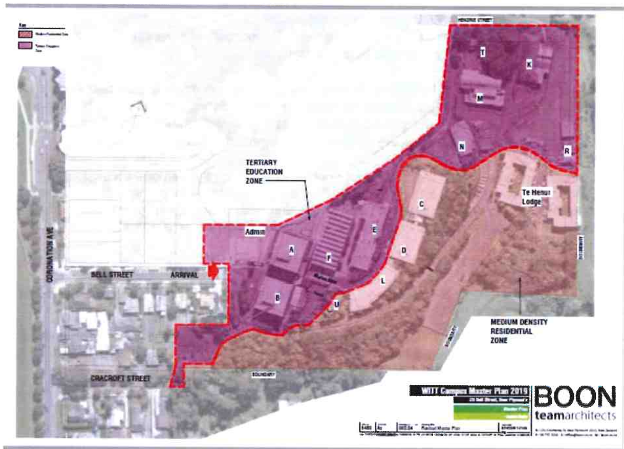
Figure 2: Proposed Rezoning

In line with WITT's master plan to consolidate and rationalise the campus it is proposed that approximately half of the existing campus is rezoned to Tertiary Education Zone while the other half containing land and buildings surplus to requirements retains the currently proposed Medium Density Residential Zone.