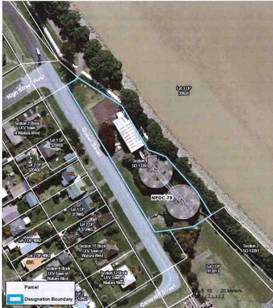
Figure 1: Waitara Sewer Pump Station Designation Boundaries

The site to which the proposed designation relates is located within the Industrial C Environment Area, Hazard Flood area and Volcanic Hazard area in the Operative District Plan. The site adjoins residential development on the western side of Queen Street, Industrial land to the south and Waitara River to the east.