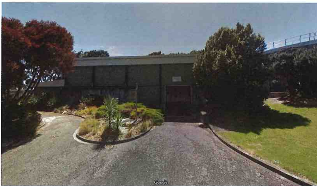
Figure 3: Waitara Sewer Pump Station – main building housing controls, screenings removal, wet well and pumps.