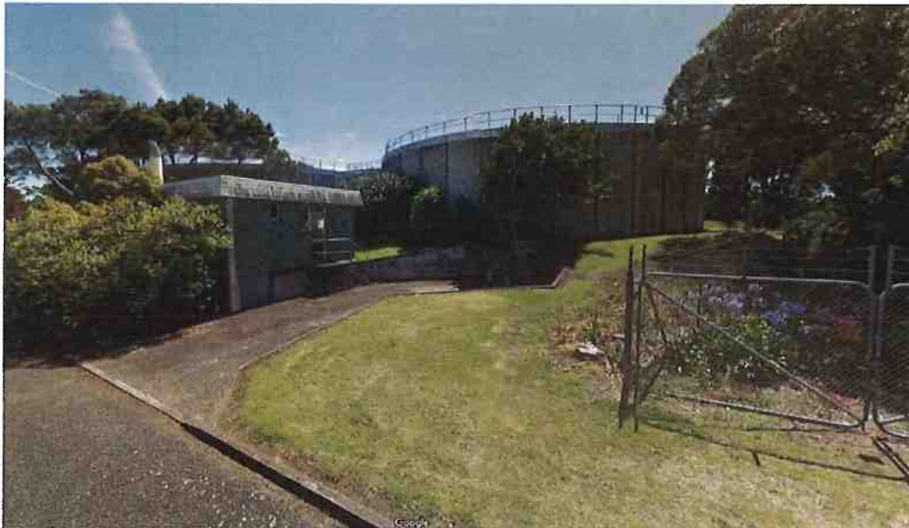
Figure 2: Waitara Sewer Pump Station - small adjacent pump station.