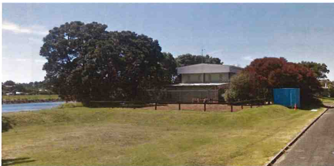
Figure 4: Waitara Sewer Pump Station – biofilter for odour removal.

The site contains established landscaping which partially screens the reservoirs and ancillary buildings when viewing from Queen Street and the Waitara River.