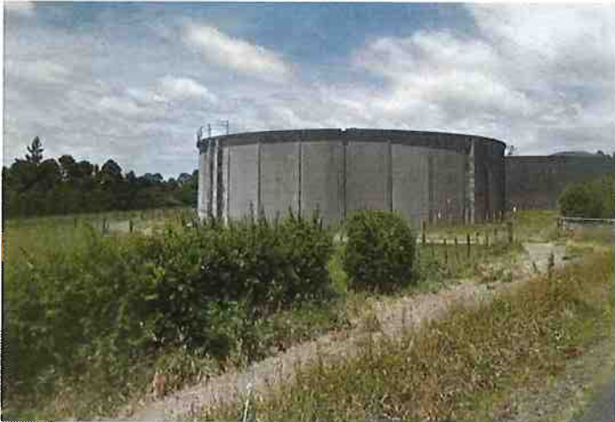
Figure 2: View into the site from Dudley Road (Upper)

The designation of the site will involve no more than a minor change to the effects on the environment associated with the use or proposed use of land and it is therefore considered to meet the requirements for a minor alteration under S181(3) of the Resource Management Act 1991.