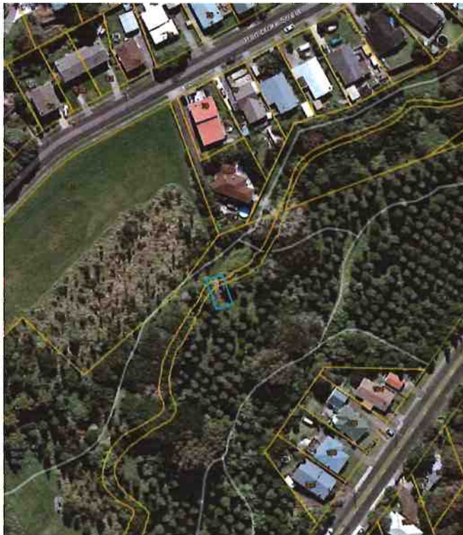
Figure 3: Brois Street Detention Bund designation boundaries (blue)