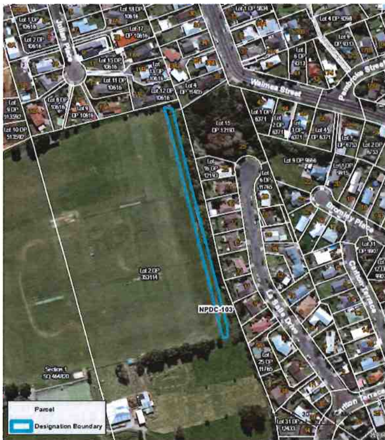
Figure 1: Waimea Street Detention Bund designation boundaries

The site to which the proposed designation relates is located within the Residential Environment Area and Flood Hazard area within the Operative District Plan. The site is located within the grounds of Francis Douglas Memorial College and is adjoined by residential dwellings at lower contours to the east.